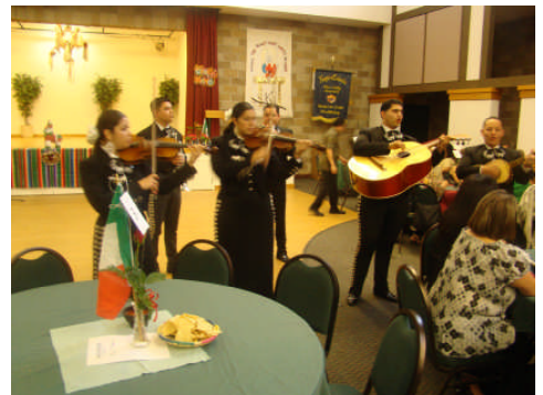
The mariachi group "Jinetes" entertained a smaller crowd on Cinco de Mayo.

A number of factors appear to have influenced the outcome. The economy had a negative impact as did the limited assistance provided by our members with ticket sales after the Sunday masses. The council will look into the matter and make adjustments to improve participation and sales for future events.