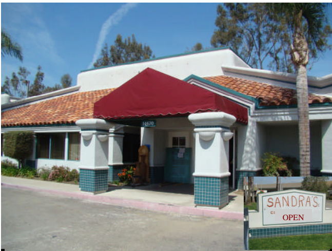
Sandra's Mexican Grill & Cantina is now open at 14670 Pipeline Ave., in Chino Hills.