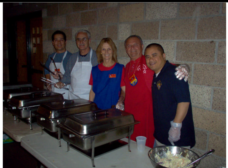
Just one of the happy crews that worked at this years Fish Fry Dinners

"The Masons against the Knights of Columbus," he responded. "What's the score?" "I don't know. It's a secret."