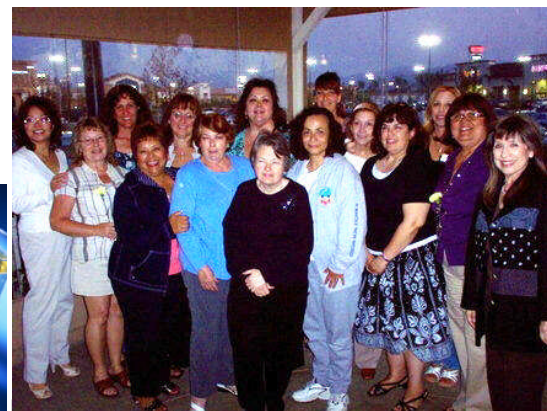
The Knight's wives are Appreciated at Lucille's BBQ at the Commons in